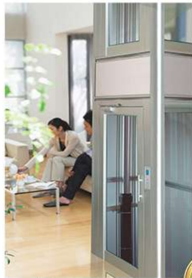
Personalised Lift for individual Villa