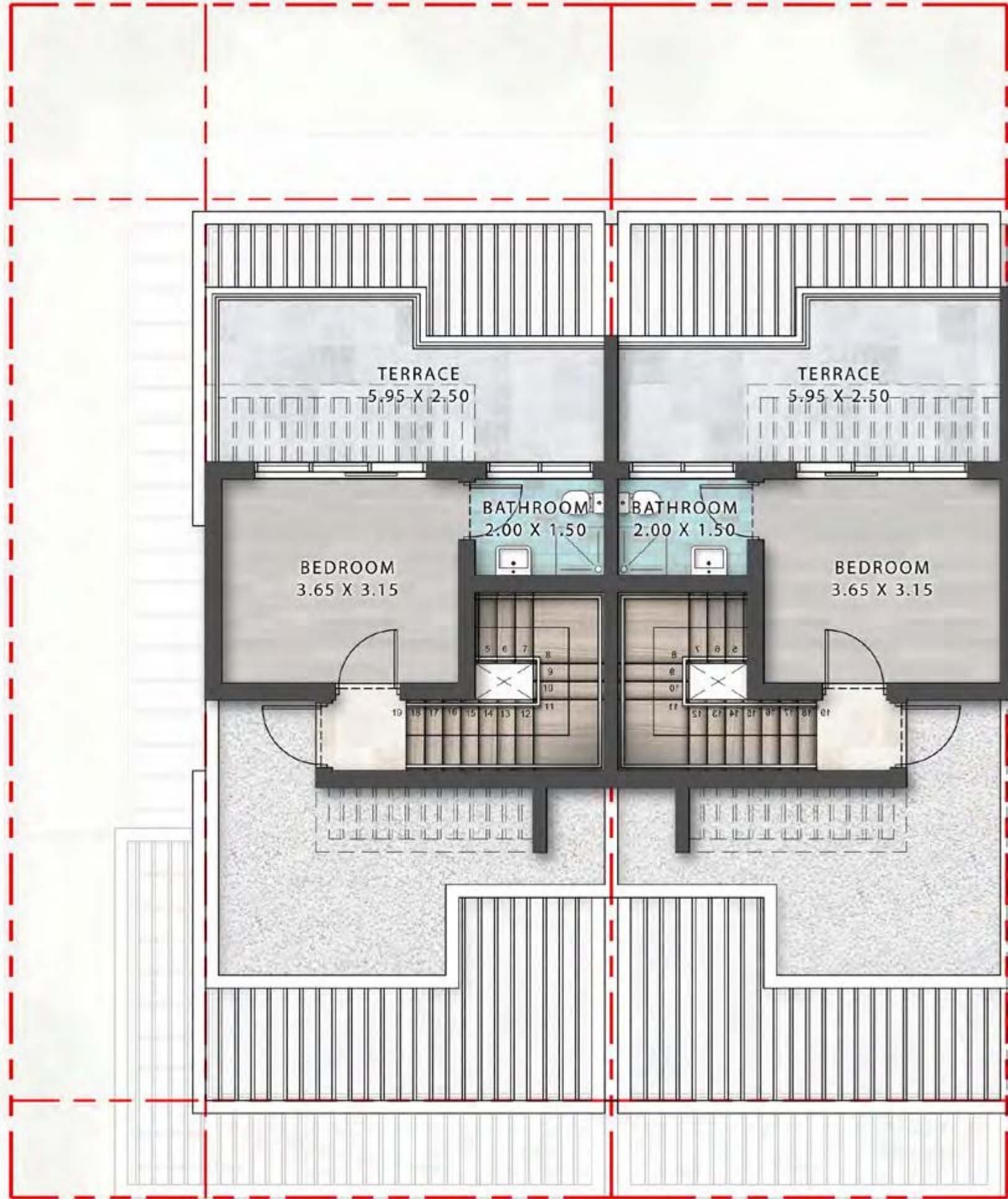
ROOF FLOOR (FUTURE EXPANSION)